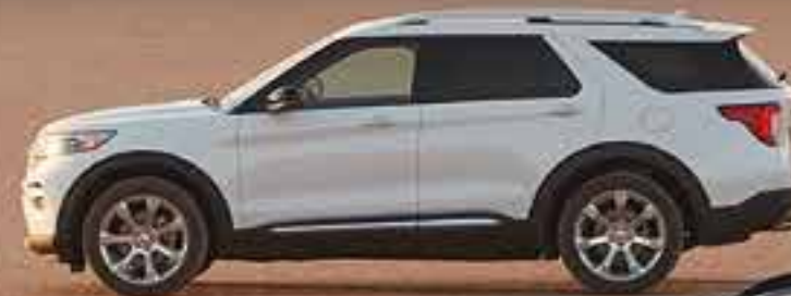
PLATINUM | Available 21" Premium Aluminum Wheels