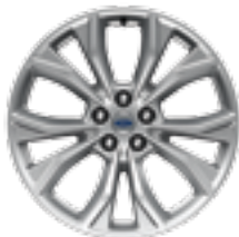
20" POLISHED ALUMINUM 3 Available