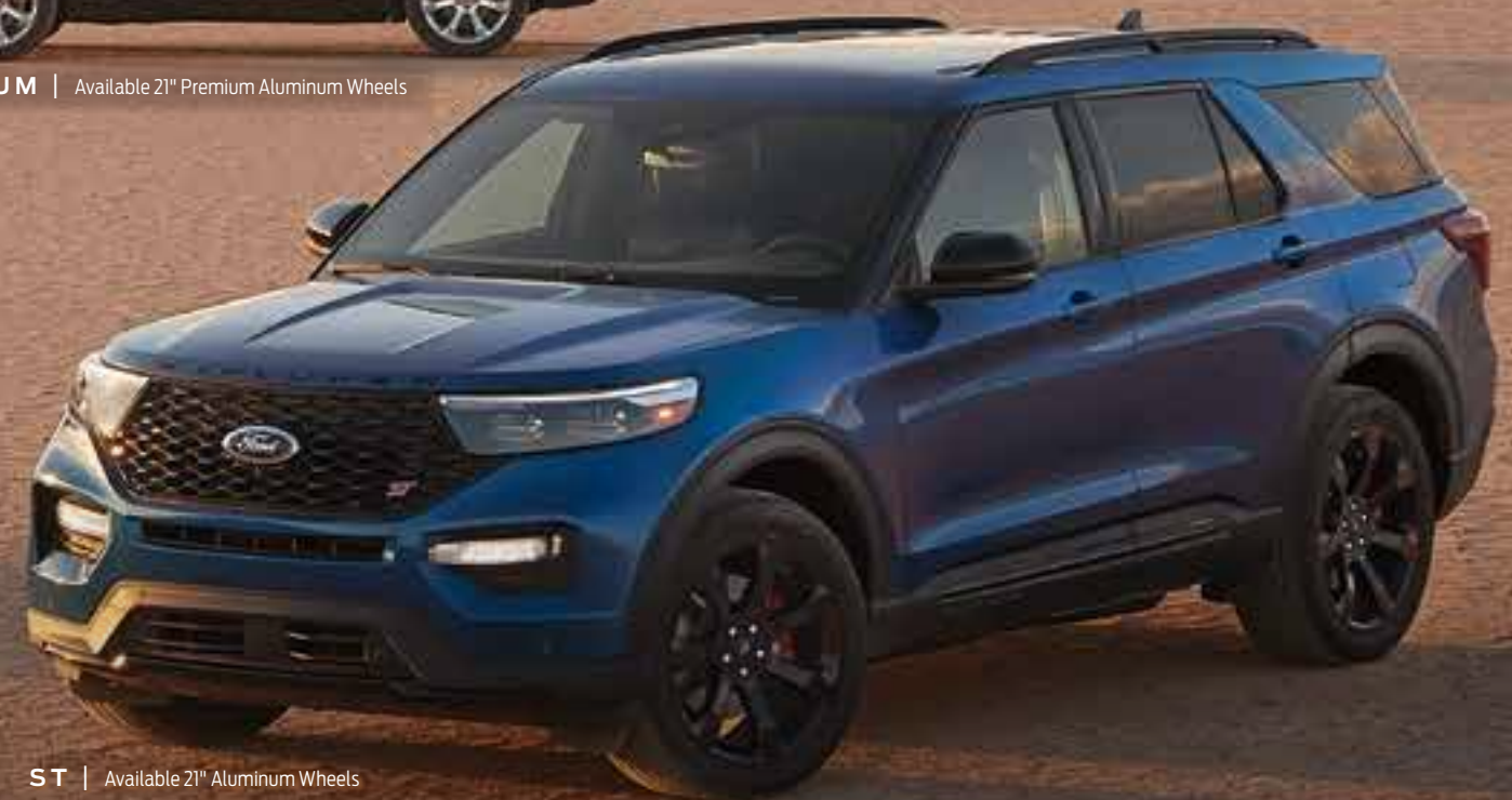
ST | Available 21" Aluminum Wheels