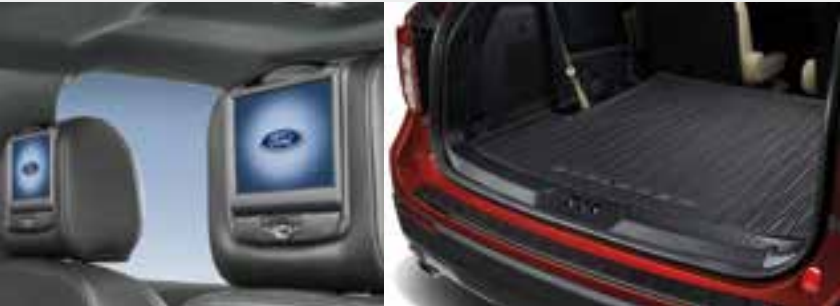
Rear seat entertainment systems 1