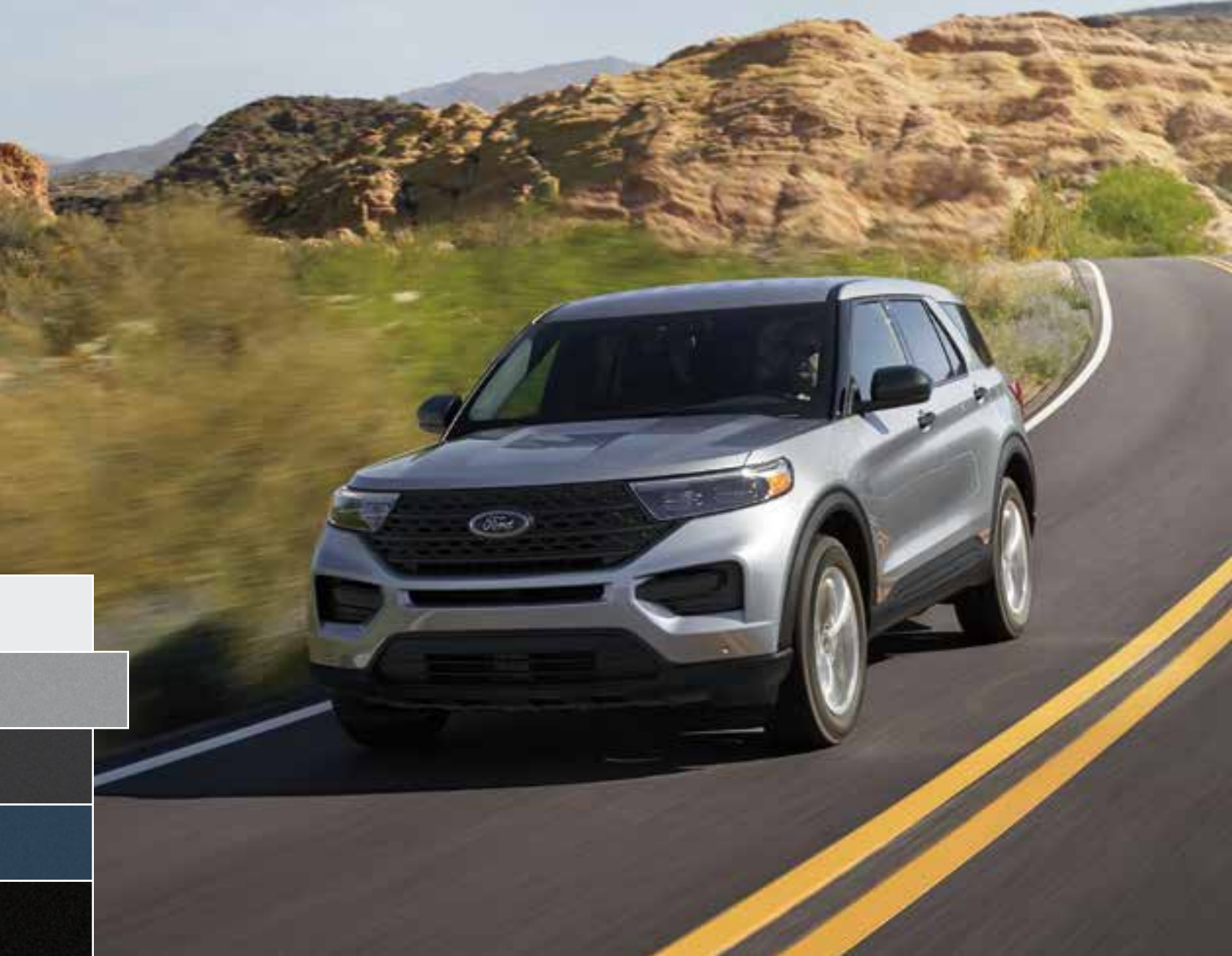
COLORS: Oxford White, Iconic Silver, 5 Magnetic, 5 Blue, 5 Agate Black 5

If you need room for the whole crew, Explorer seats up to 7 passengers in sophisticated style. A standard power liftgate makes for convenient loading/unloading of gear, while FordPass Connect™ with 4G LTE Wi-Fi hotspot capability lets you – and the crew – stay connected on the road. Ford Co-Pilot360™ and Side-Wind Stabilization help increase your confidence the moment you leave. In RWD or available 4WD, 300 hp 2 and 3,000 lbs. of max. towing capacity 3 give you the power you need. Explorer is the all-time best-selling SUV in America, 4 and the all-new Explorer is better than ever.