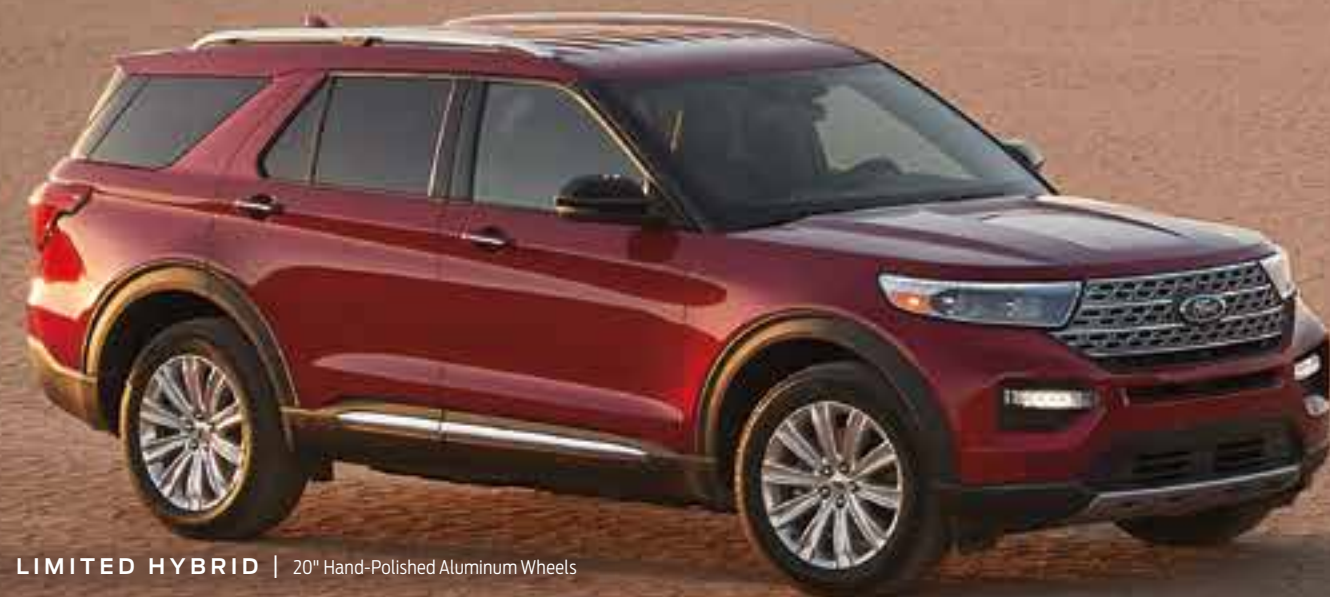
LIMITED HYBRID | 20" Hand-Polished Aluminum Wheels